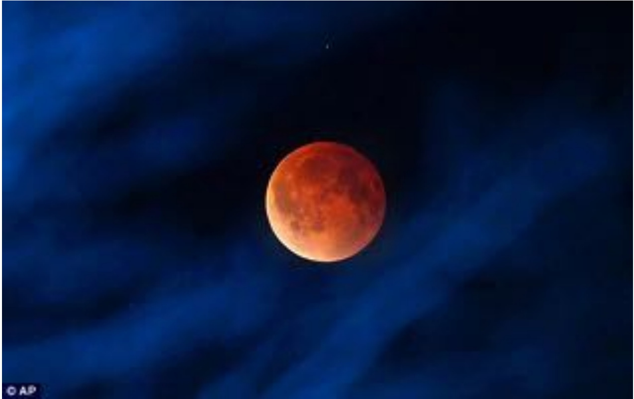
Illuminating: The moon glows orange, as seen from Milwaukee in the USA